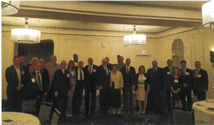
Some members of the Chicago Consular Corps after the elections and general meeting.