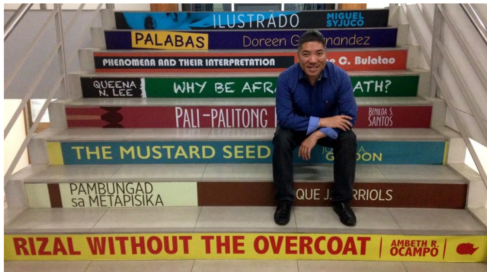
Prof. Ambeth Ocampo

Titled “ Rizal: The Hero as a Traveler, ” Dr. Ocampo’s lecture will be held on Tuesday, 11 June 2019, 5:00 – 7:00 p.m. at the Elson Place Market Mix (beside Seafood City Supermarket) located at 5033 North Elston Avenue, Chicago, Illinois 60630.