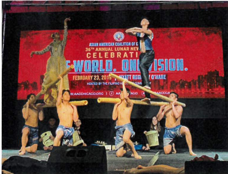
Kapit Bayan Dance Group performing Badjao dance